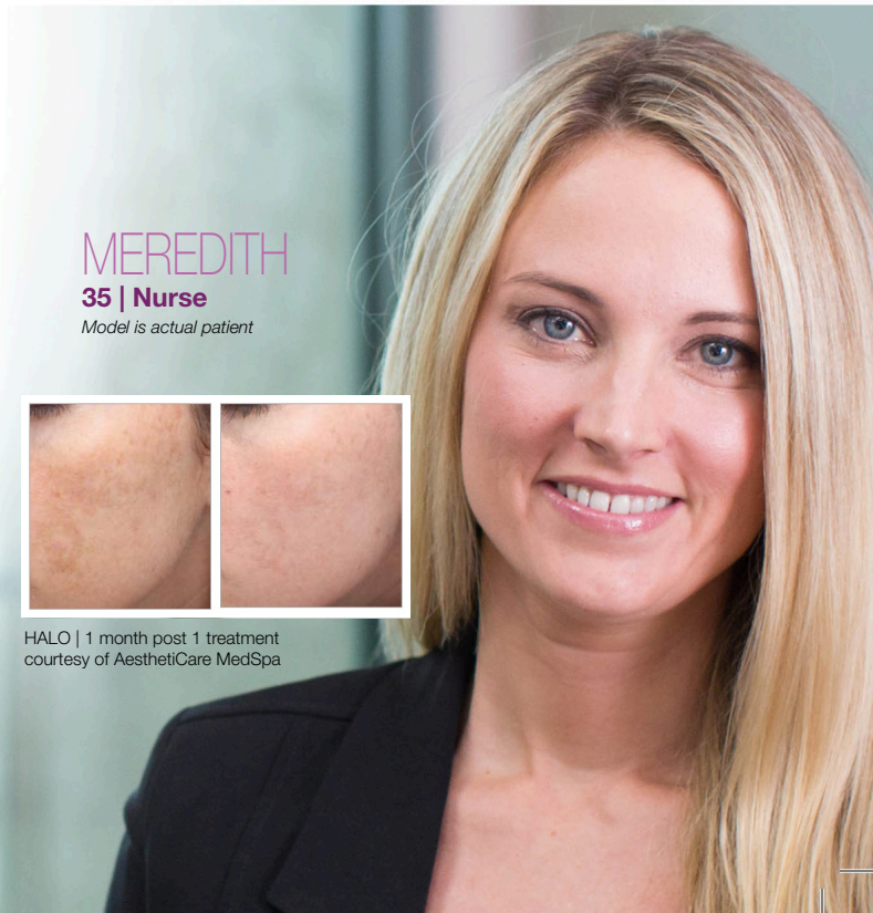
HALO | 1 month post 1 treatment

Your HALO results can last for years to come, as long as you continue to keep your new healthy skin protected at all times using UV sunscreen.